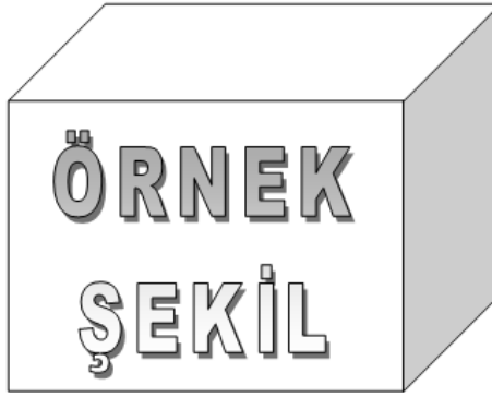
Figure 2.1 : All tables and figures must be horizontally centered on the page.

All tables and figures must be horizontally centered on the page.